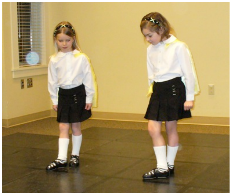
STARTIN' OUT: Young dancers doing beginning steps