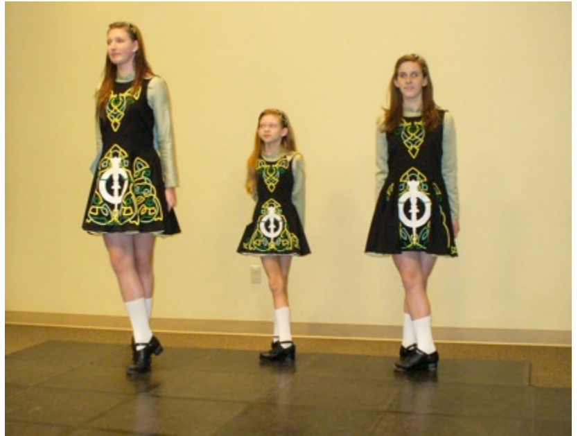
STEPPIN' OUT: Hard shoe Irish dancing